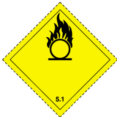
FIGURE 7.3.L Class 5—Oxidizing Substances (Division 5.1)